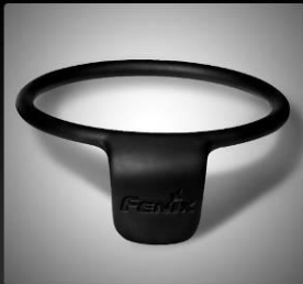
Medium for 24mm-30mm