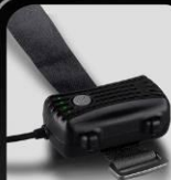
BA2B Battery Pack