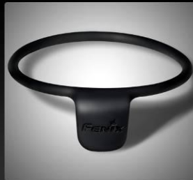
Large for 30mm-35mm