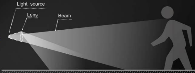
Fenix Bike Light

The upward beam of the Fenix bike light is refracted to the ground rather than shine into the eyes of pedestrians.