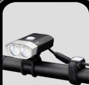
BT30R and remote switch