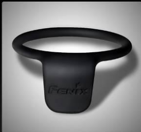
Small for 20mm-24mm

Compatible with various kinds of handlebars.