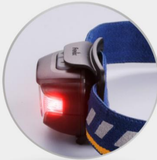
Convenient red light mode