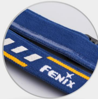
Reflective, sweat -block headband