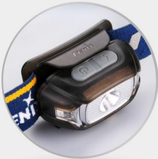
Dual switch design