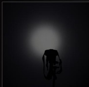
Eco (10 Lumens)