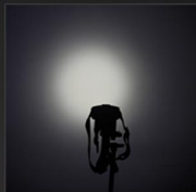
Mid (165 Lumens)