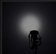
Low (55 Lumens)